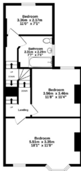
3rd Floor 27.7 sq.m. (298 sq.ft.) approx.