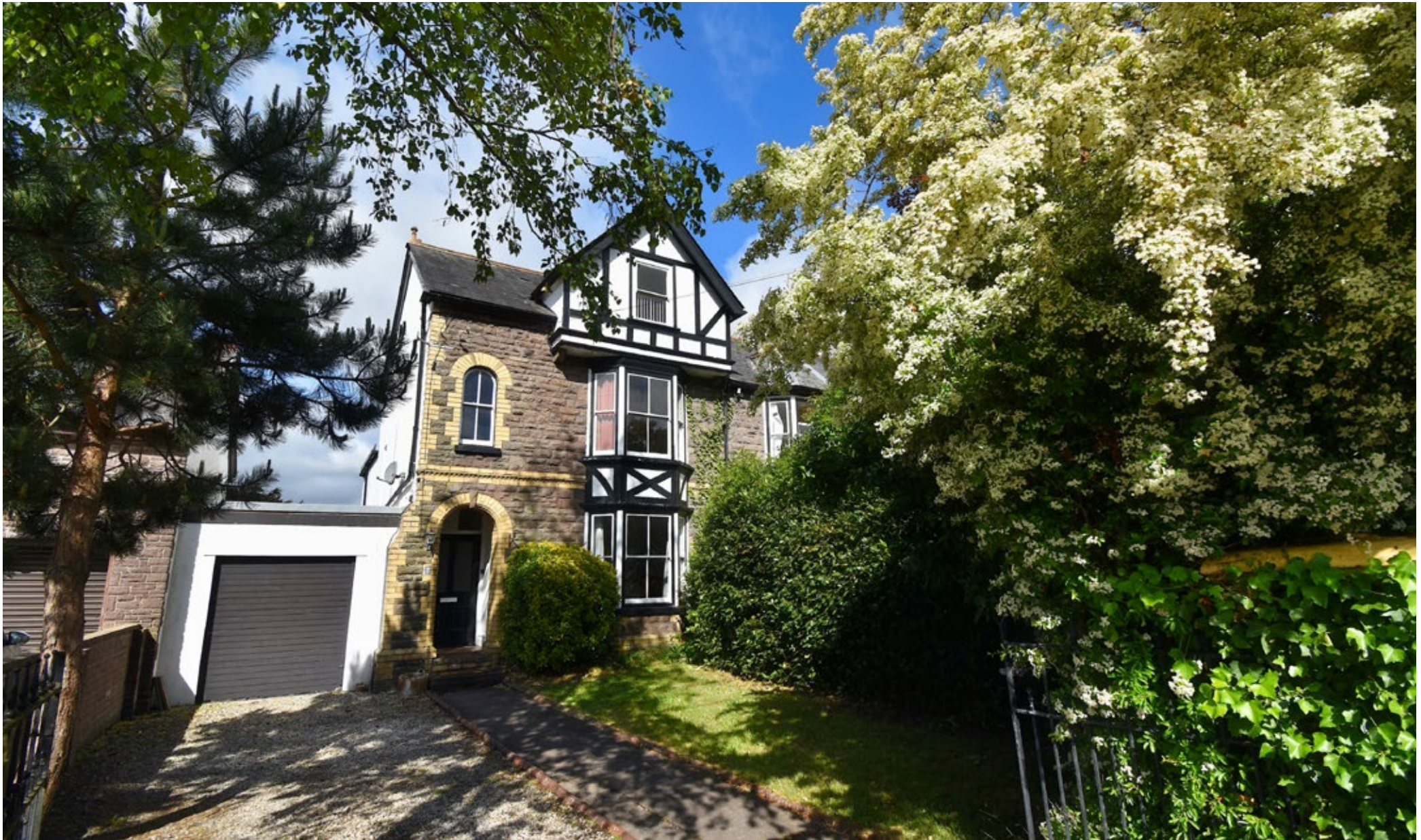
Lydstep, 2 Windsor Road Abergavenny | Monmouthshire | NP7 7BB