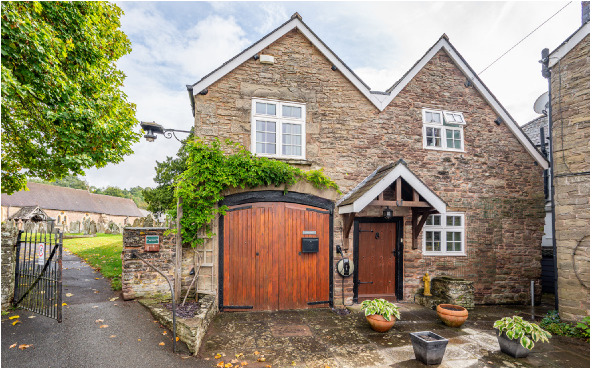
Monks Retreat Ewyas Harold | Hereford | Herefordshire | HR2 0EX